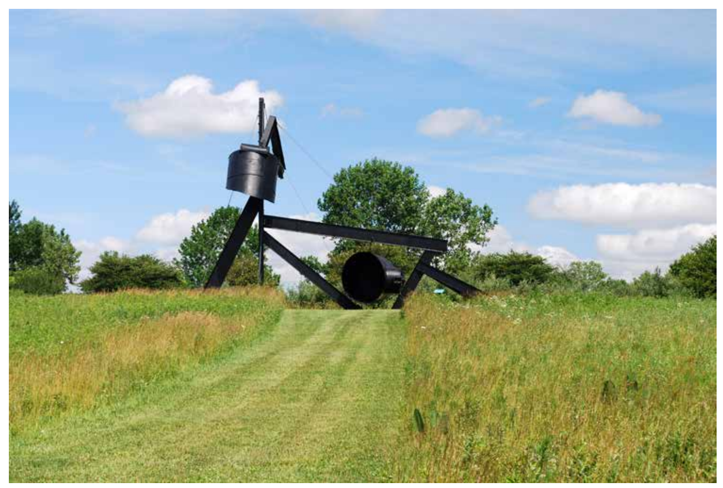
Yes! for Lady Day 1968-69; Mark diSuvero; Gift of Lewis Manilow

Flying Saucer , Jene Highstein's 1977 work that holds down the western section of the park, is scheduled for work this summer. Over the past 16 years it has developed a series of cracks that threaten the structural integrity of the artwork. The work is expected to take 2-4 weeks and will result in a presentation that more closely resembles the artist's vision than the current state of the sculpture. Stay tuned and make sure you visit Flying Saucer after July 1!